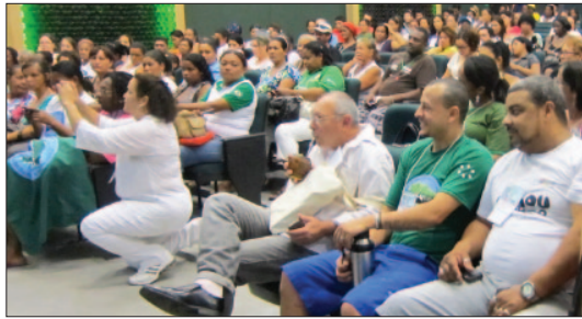
Feedback meeting about phase one of the project at the Waste and Citizenship Festival, 2012