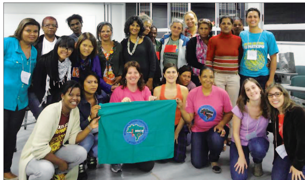
Group photo of women participants in the workshop for the metropolitan region of Belo Horizonte

Demonstrating how participatory methods are essential in exploring the many levels of submission and discrimination women waste pickers face, in creating resources for their empowerment, and in creating opportunities for their economic autonomy.