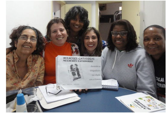
Drafting popular gender toolkit

“ We have to get involved in politics to better achieve our rights.”