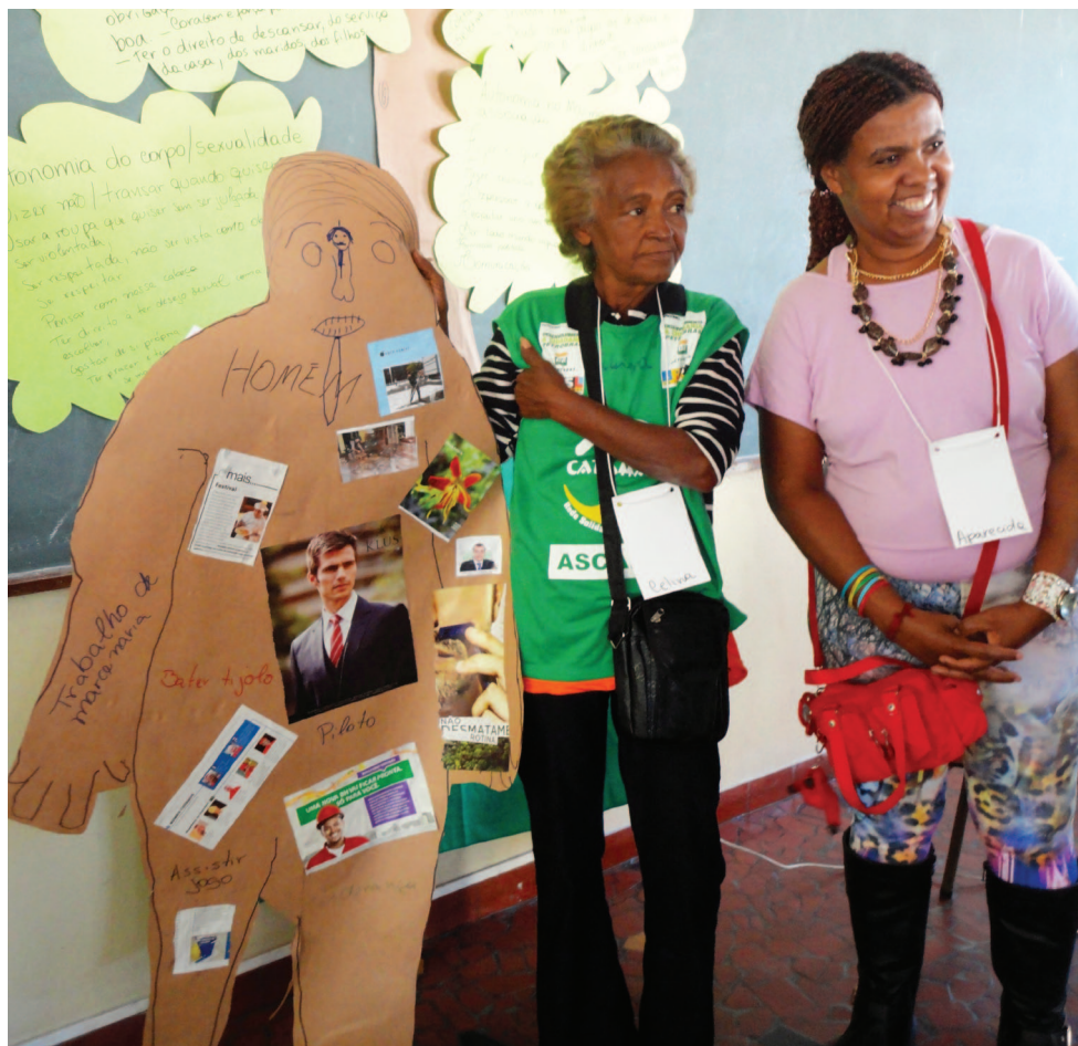
Gender roles in discussion.

More information: Website: wiego.org/OHS / Facebook: facebook.com/wieglobal / Twitter: @WIEGOglobal